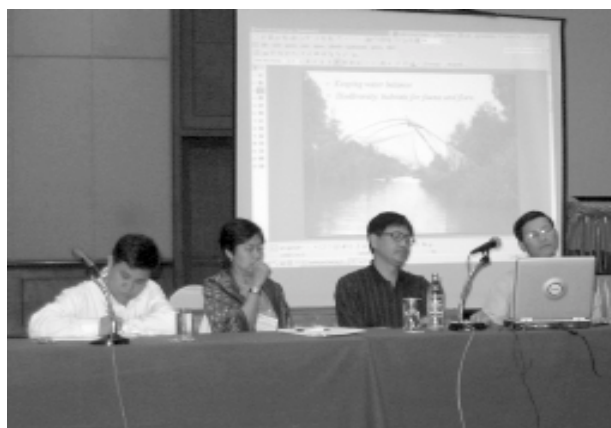
Mekong Learning Initiative panel at SEAGA Conference in Khon Kaen, Thailand, December 2004.

The Mekong River Basin and the Mekong Region have increasingly become the focus for a number of regional initiatives and development agendas. However, lecturers and students in the six countries of the Mekong have relatively few opportunities for interaction, and the tertiary level curricula in each country make use of relatively little material from regional Mekong neighbours. Vietnamese, Lao, Cambodian, Thai and Chinese students studying history, geography or other social and environmental science subjects are much more likely to make use of examples from North America or Europe than from each other’s respective countries, in particular from the Mekong