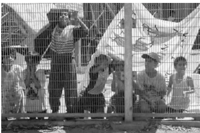
Children behind bars at Port Hedland Detention Centre, Western Australia.