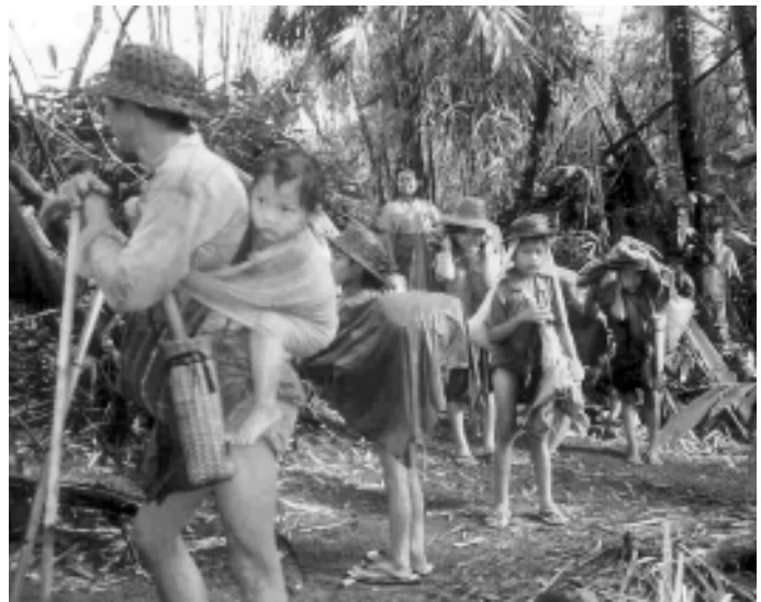
Karen refugees in Burma hiking to the Thai border where they will try to gain entrance to one of the refugee camps.