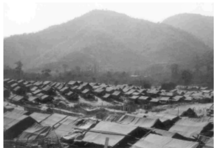
Tham Hin refugee camp on the Thai-Burma border.